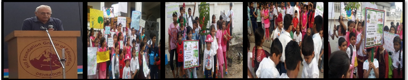
(A glimpse on Celebration of World Environment Day 2016)